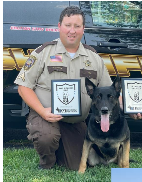
Deputy Cotton & K9 Chase