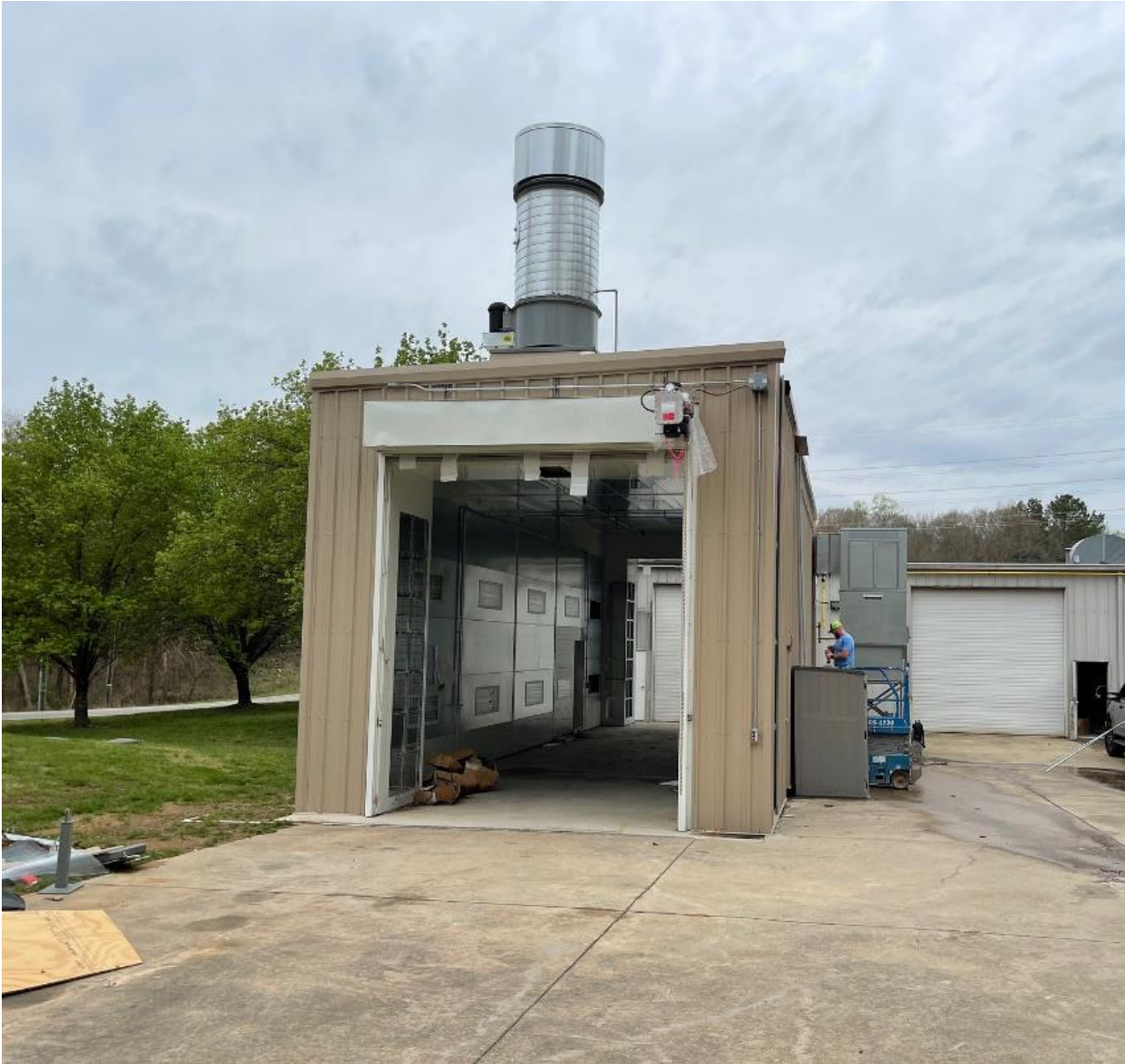
Picture of what the building will look like, this is a picture of an existing paint we had installed in North Carolina